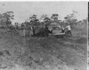
• Uma estrada vai sendo rasgada ...