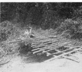
Uma ponte de emergência, sôbre um riach no seio verde da brenha.