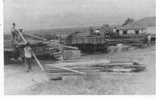
Materiais que em breve se transformarão em edificações e benfeitorias.