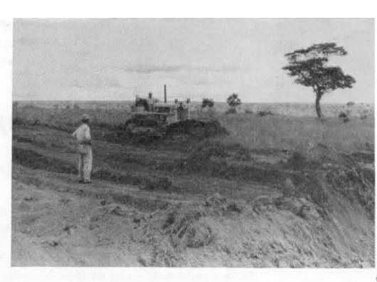
Tratores e caminhões em plena atividade.