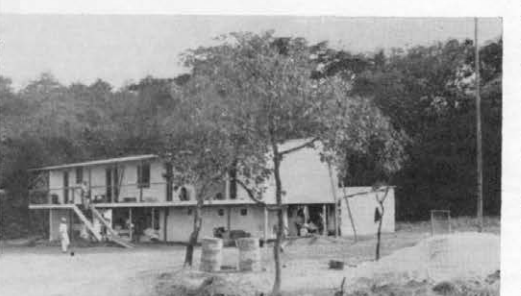
Um palácio provisório de madeira edificado, por iniciativa de amigos do Sr. Presidente da República, em pouco mais de dez dias.

Homens, máquinas, entusiasmo, ação. E Brasília é uma idéia que se concretiza, um empreendimento que avanca em ritmo acelerado.