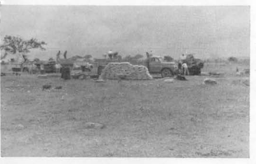
A primeira descarga de cimento em Brasilia.