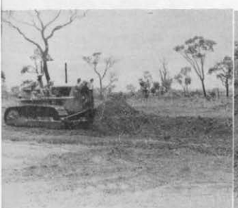
Prosseguem os serviços de terraplenagem e nivelação de áreas.