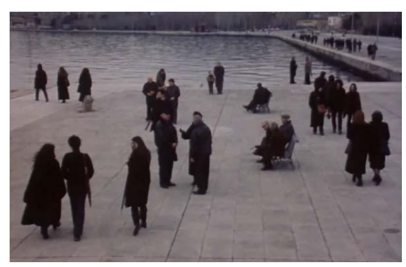
[Fig. 16–17] Theo Angelopoulos, Film stills, Eternity and a Day, Thessaloniki, 1998