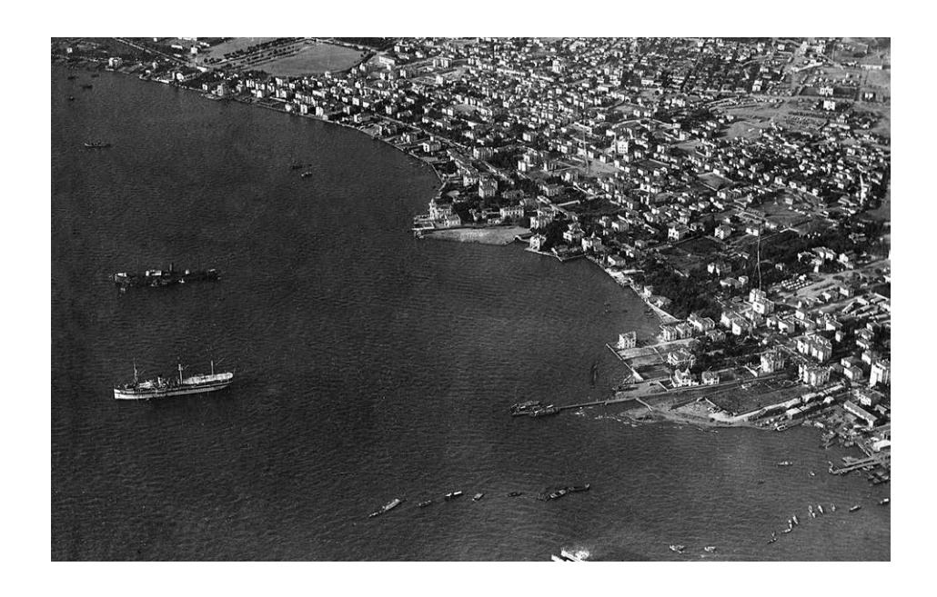
[Fig. 1] Villas on the waterfront, Thessaloniki, 1915–1917