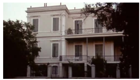
[Fig. 14] Vassilis Colonas, The Emanuel Salem villa by Xenophon Paionidis built in 1906, Thessaloniki, 1980s