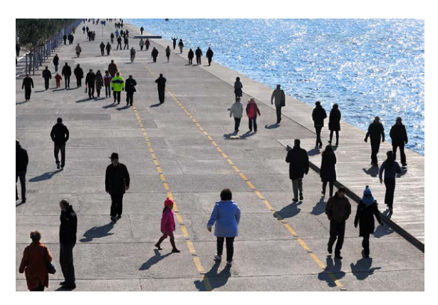
[Fig. 19–21] Yiorgis Yerolymbos, Thessaloniki newwater seafront, Thessaloniki, 2009; www.yerolymbos.com/architecture/thessaloniki-new-water-seafront/; © Yiorgis Yerolymbos