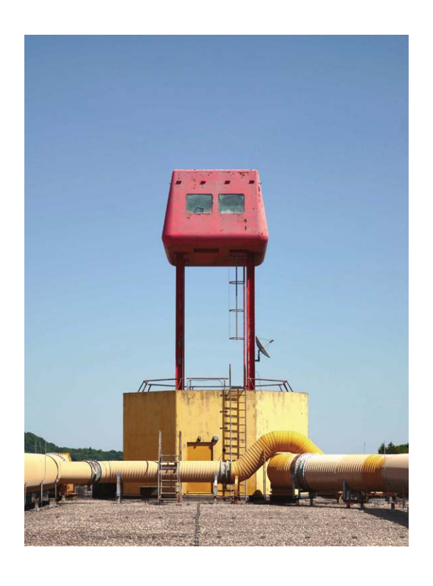
\label{eq:continuous} \begin{tabular}{ll} Fig. 04] \\ Andre Mangad, Carlos Schrewe, "Sommerfeldstr. 18 – 52074 Aachen", 2022; RWTH Aachen University, Aachen. \\ \end{tabular}

Nevertheless, the students' works assembled some stylistic features made popular by the Bechers such as monochrome backgrounds, front views, flatness and one-point perspective. In contrast to the Bechers, all students in Aachen chose colour photography, a fact that was amongst others influenced by the bold use of colours in the buildings. (Fig. 04)