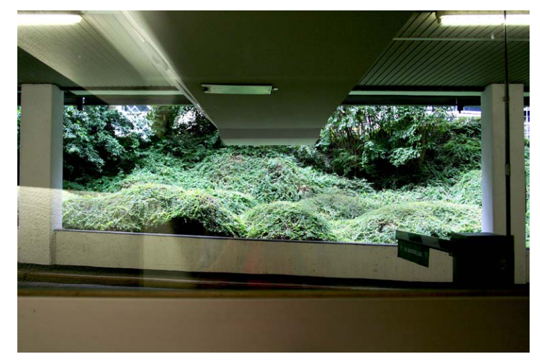
[Fig. 07] Hannah Gobien, Jakob Polster, Lagerhausstr. 20 – S2064 Aachen, 2022; RWTH Aachen University, Aachen.

The individual photographic approach of the students was a result of the intensive work on the object, its history and above all the architectural qualities of the specific building. Corresponding to the heterogeneity of the objects, the series turned out very different. While some projects concentrated on the surroundings (Fig. 07) or the socio–political context, others broached the issue of the usage by the habitants or focused on the architectural stylistic form of the object in detail. In the end, each work provided a specific analysis of the advantages and disadvantages of the pictured architecture. But in order to make a difference in the perception of these buildings the material had to be made accessible to a wider public.