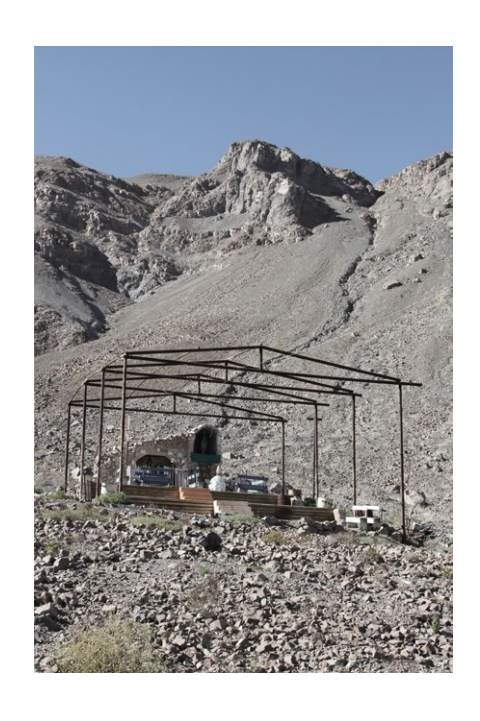
[Fig. 4] Altar of the virgin in the abandoned mining town of "Llanta", 2018.