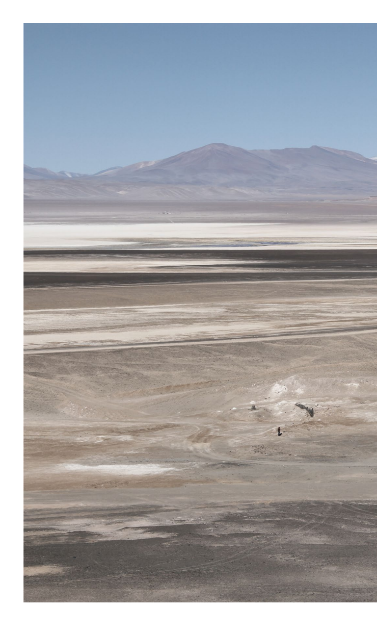
[Fig. 8] Archaeological ruins in lithium extraction salt flat, 2018.