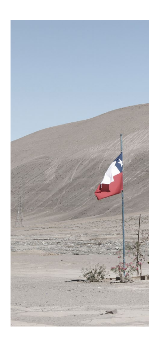
[Fig. 2] Memorial site. "Animita", 2017.