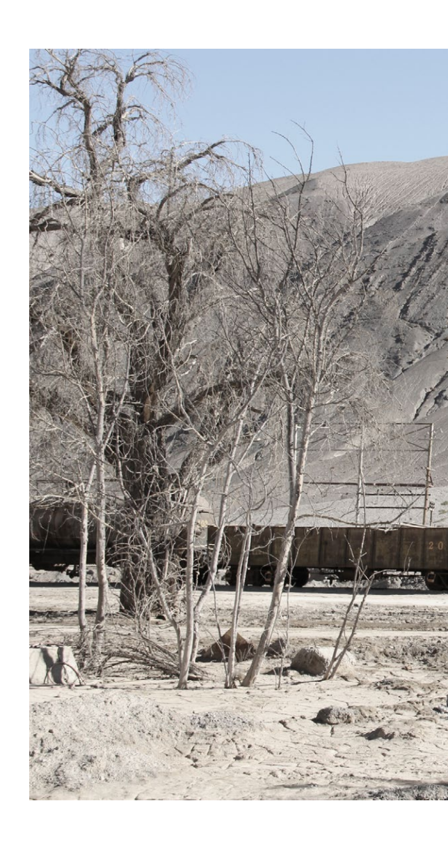
[Fig. 3] Railroad cars in the abandoned mining village "Llanta"., 2017.