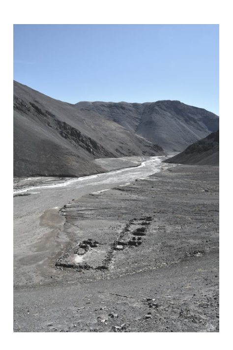
[Fig. 6] Archaeological ruin related to the Inca road system in Chile, 2018.