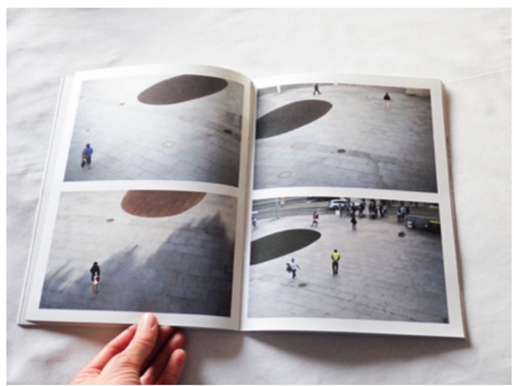
ANA MIRIAM Spreads from: "Clareira: Estar, Não Estar, Passar", 2018

Three small elements are accordion bound, offering different folding possibilities that allow the reader to associate images freely. The object can also be fully extended, or spreads can be observed individually. Noite and Anoitecer were shot in low light conditions, one during the night and the other at twilight. In these cases, accordion binding favours the merging of images into each other.