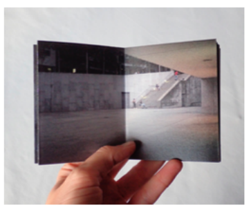
ANA MIRIAM Clareira: Anoitecer", 2018

Images are revealed as the paper is unfolded, in one case simultaneously and in the other in a sequence of three moments. Ciclo focuses on the seasonal changes of a group of trees, placed at the center of the space. It is bound only by a ring, around which individual images are turned, having no beginning or end.