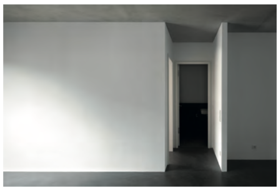
Kiefholzstrasse, Berlin, Germany. Marius Schliekmann Architekten, 2014