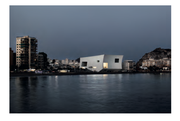
MARIELA APOLLONIO Aguilas 3

The current state of play in architectural photography is the image mechanism at its peak. The mass media dominates architectural projects, architects and the way of displaying or photographing them. The architectural photographer has become a producer of advertising images to enhance the photographic appeal of the building, not necessarily its complexity or significance. Architectural photography, following in the steps of computer rendering, has created a world of simulations inherent to it. It has turned into a 'different' architecture with which the architecture of phenomena and materiality cannot compete. Does the image mechanism represent the cultural value that we want to project of architecture today? Would it be possible to consider an architectural photograph beyond the bounds of this inherited system?